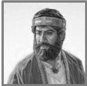
Rehoboam, King of Judah