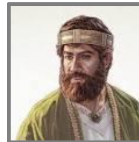
Rehoboam, King of Judah