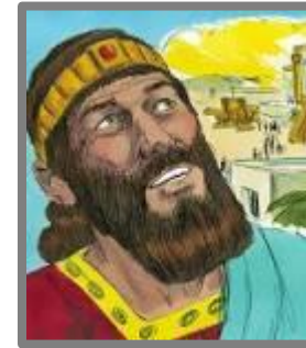
Jeroboam, King of Israel