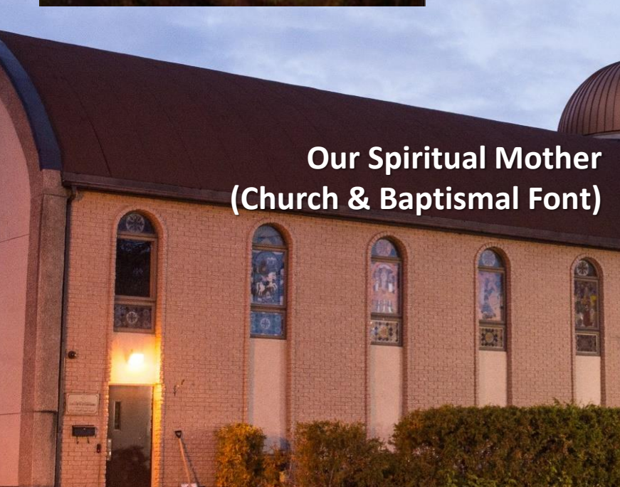
Our Spiritual Mother (Church & Baptismal Font)