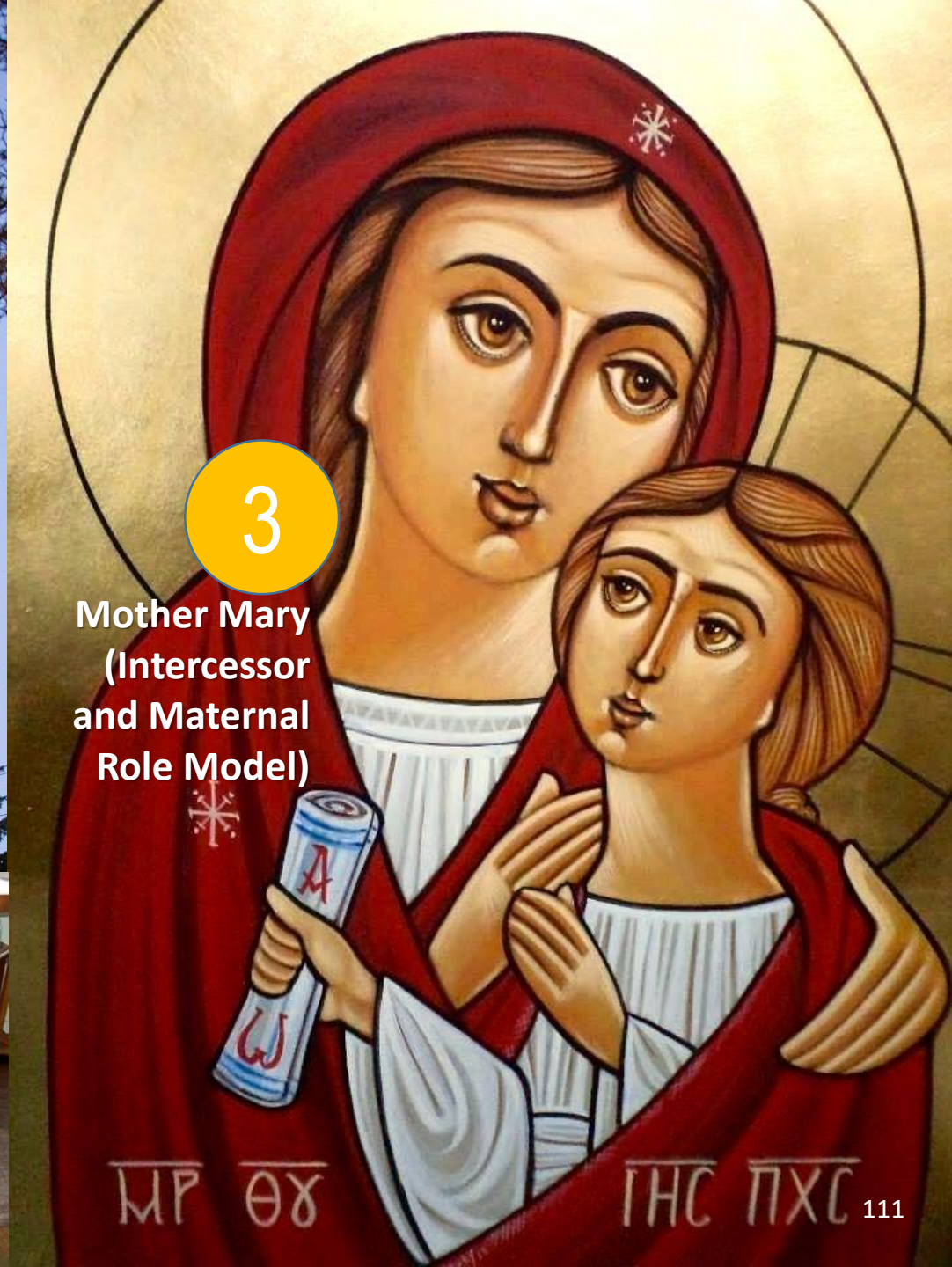
Mother Mary (Intercessor and Maternal Role Model)