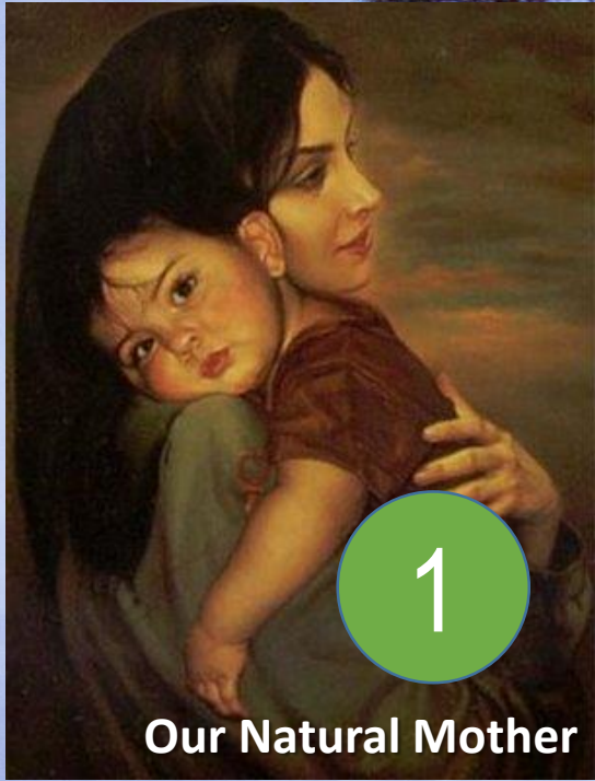
Our Natural Mother